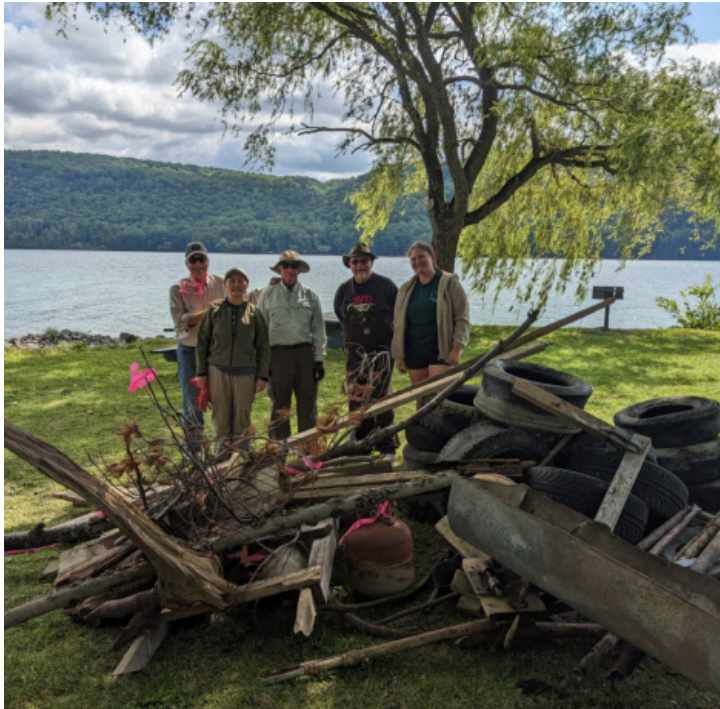
ABOVE & RIGHT: 2024 Lake Clean Up; Photos by Debbie Creedon