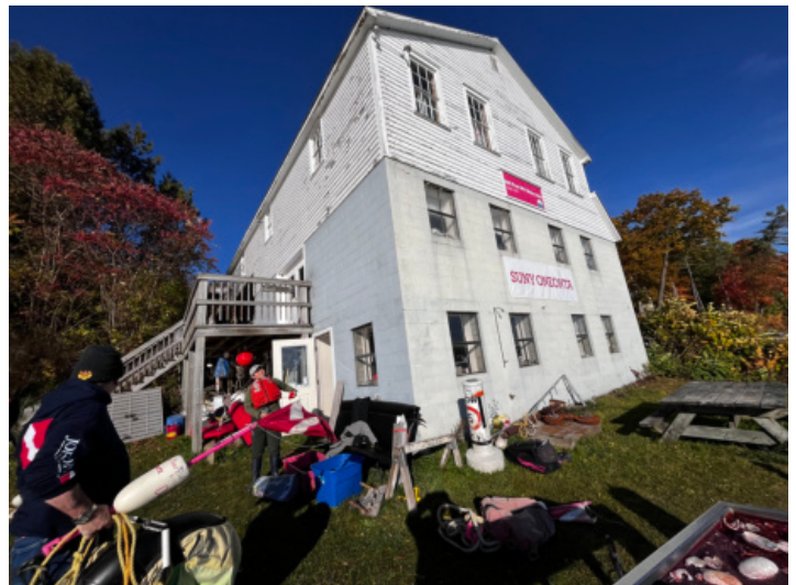
ABOVE: Loading up the boats with equipment; Photo by Ellie Vogl.

Thank you for watching out for the NWZBs for the 2024 season!