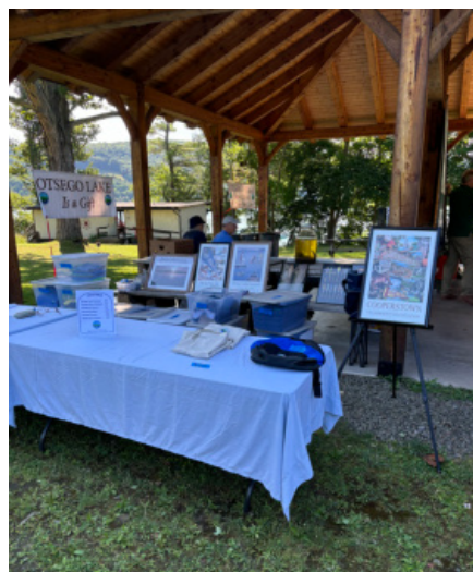
2024 Annual Gathering