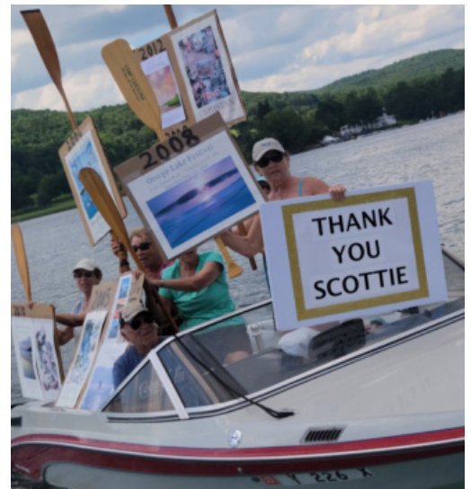
Boat Parade Highlights - Super Hero, Posters through the Years; OLA, Scottie Love; Photos by Tina Claiborne.

All boats, large and small, were welcomed including antique or classic, human powered, wind powered, electric powered, jet powered, outboard powered, inboard/outboard powered, and, of course, any other “flying boats”. Participants were encouraged to decorate their boat using the theme of “Let's Celebrate Scottie Baker” but they could decorate their boat anyway they wished. Many were unusually decorated, humorously decorated, patriotic theme decorated, joyful/party theme decorated, sports theme decorated, military theme decorated, and, of course, several were decorated to honor Scottie Baker. Several boats were not decorated but just joined in the parade while other boats