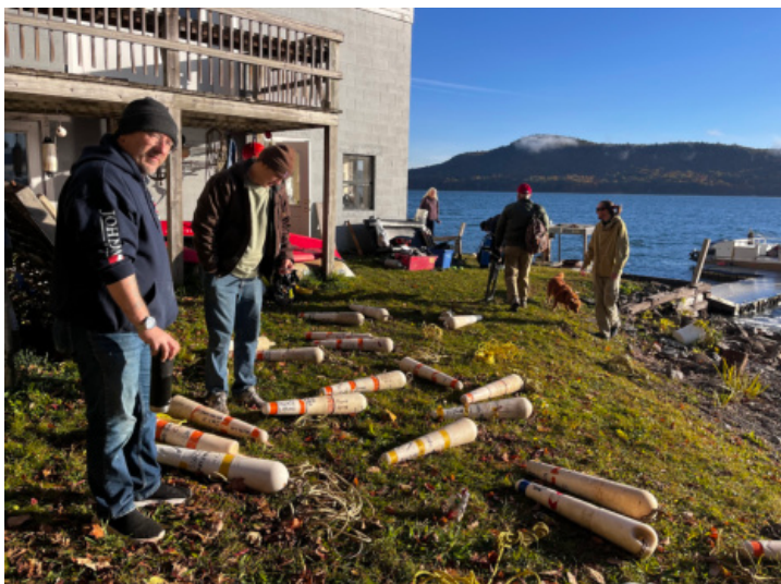
Getting the location-specific spar buoys ready; Photo by Ellie Vogl.