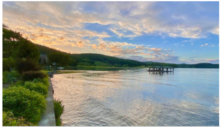
The image credit for this photo on our Spring 2024 issue cover was incorrect. CORRECTED ATTRIBUTION: Ripples:

Our annual Lake Clean Up Day was held this year on Saturday, August 11. We were able to clear debris from both the west and east shore areas and had good participation from the community in putting out their debris on the edges of their docks where it was picked up by boat for disposal. Thank you to our OLA volunteers who help keep our lake clean!