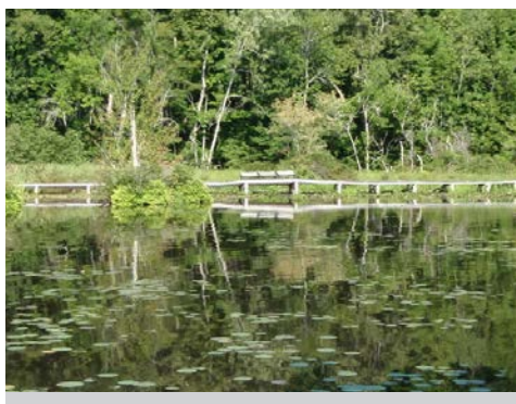
Goodyear Swamp Sanctuary Boardwalk: I

Ultimately, we all found our footing and the gears of bureaucracy began grinding forward again. During the delay we found that some documents had expired and needed to be redone. That meant new signatures, new notarizations, new authorizing resolutions. It seemed for a while that every time we sent a pile of documents to our program officer at the state, the response would be, "This is great, but..." It was quite the process.