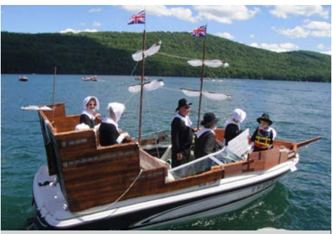
2017 Boat Parade, Photo by Tim Pokorny.