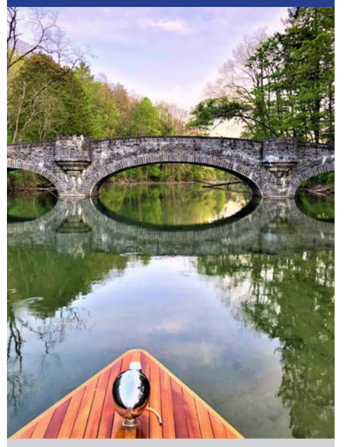
ABOVE: Distancing on the Susquehanna; BELOW: A Snowy May 9

DID YOU KNOW? No objects may be moored in the lake without a permit from the Department of Parks, Recreation and Historic Preservation, except one orange and white swim buoy. There is an application form for a floating object permit.