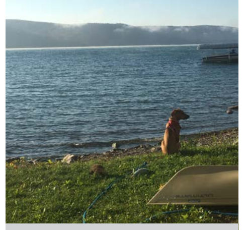
Ziggy on Otsego Lake