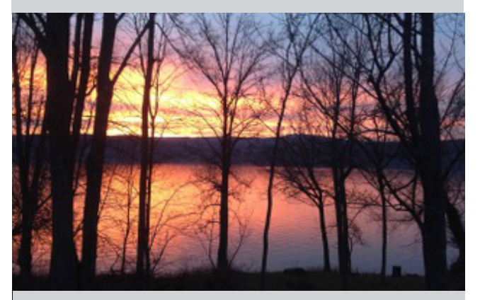
Sun on Winter Lake, Pati Grady "Nothing ever stays the same and we never catch up." - Emily Carr