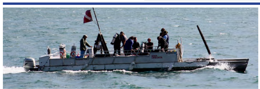
"Guardians of the Lake" doing their thing....each year. Bringing in the buoys that make boating safer for all!