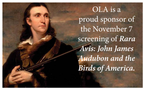
Join Delaware-Otsego Audubon Society at noon at the Fenimore Art Museum patio for a free bird walk before the film!

boat wash effort whether they be in merchandise sales, new memberships, or tax deductible contributions sent to our post office box. Most importantly, I urge you to spread the word and encourage you to educate others about the significance of these efforts in preventing the contamination of our waters and their importance in preserving our most precious natural resource, Otsego Lake. Thank you for your support and for your commitment to preserve and protect "our Glimmerglass".