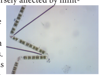
Photomicrograph of Planktothrix rubescens (thinner purple filaments) along with a filamentous green alga (Zygnema sp.) for color comparison. The purple filaments were 5-7 microns wide.

ed gas exchange with air or sunlight. Even in Otsego Lake we have had localized bloom of P. agardhii in the past which manifested as fine green flakes. Otsego Lake, however, is not as eutrophic as Canadarago Lake, and the dilution effect keeps these blooms localized and to the level where we do not have to close beaches and issue water usage advisories. It however is important that we try to keep our lake in this condition by monitoring water quality con-