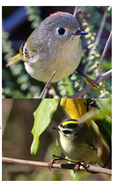
Top: Ruby-crowned kinglet; Bottom: Golden-crowned kinglet.

On Public Landing Road, I watched a downy woodpecker peck at a gall on a mustard stalk for a protein rich meal. I am told by a very reliable source that loons are on the lake. We are indeed fortunate. - Becky Gretton