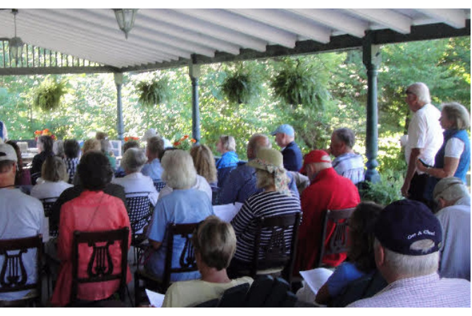
OLA 2015 annual meeting at the Otsego Golf Club on the north end of the lake.

After much hard work, the groundwork has been laid. Permission has been obtained from the Village Board, a site plan has been generated, and bids are being solicited for a boat wash at the Cooperstown lakefront. This is an expensive project that will require a large financial commitment on our part and support from our like-minded organizations as well. Our