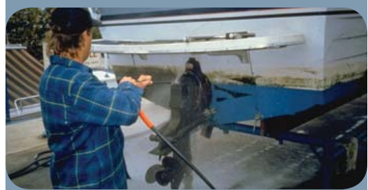
If you want to use your boat sooner, follow additional steps to make sure it is decontaminated from any hitchhikers. See the back side to find out how!

Dry your boat, trailer, and all equipment completely. Drying times vary depending on the weather and the type of material. At least five days of drying time is generally recommended during the summer.