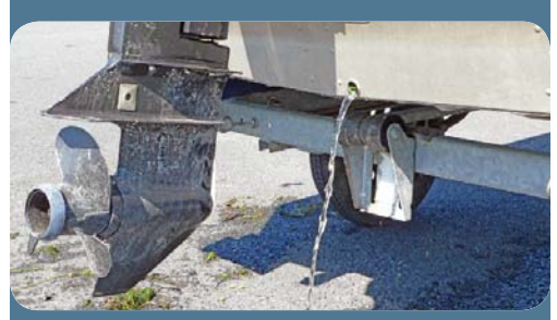
Invasive viruses, zooplankton, and juvenile zebra mussels and Asian clams can be transported in even just a drop of water!

Drain water from bilge, live wells, ballast tanks, and any other locations with water before leaving the launch.