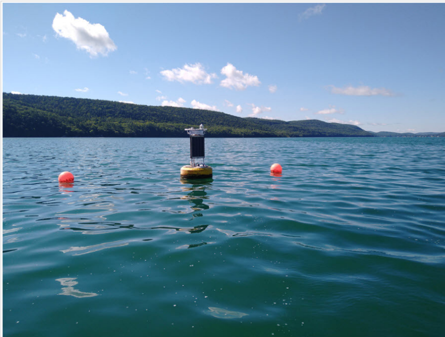
Data buoy in seemingly clean water, but the white foamy scum on the water surface contained high concentrations of cyanobacteria ( Microcystis aeruginosa ).

Throughout the years, harmful algal blooms (HABs) in the Laurentian Great Lakes have been meticulously documented and closely studied due to their annual appearance across the basin. While these blooms have become a recurrent issue in the Great Lakes region, many lakes worldwide are now facing harmful algal blooms for the very first time, with some causes still unknown.