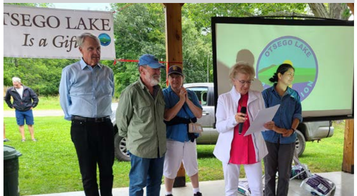
Members of the Otsego Lake Watershed Supervisory Committee accepting the OLA Lake citizen award.