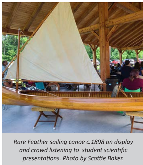
Rare Feather sailing canoe c.1898 on display and crowd listening to student scientific presentations.