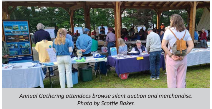
Annual Gathering attendees browse silent auction and merchandise.