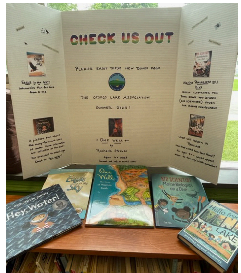
Poster and display of books at Springfield Library.

Librarians appreciate the materials. Each book notes that it was donated to the library by OLA.