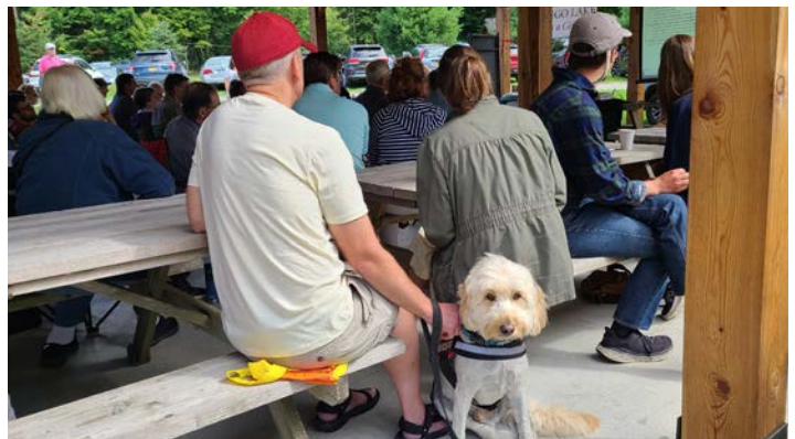
A Gathering Enjoyed.