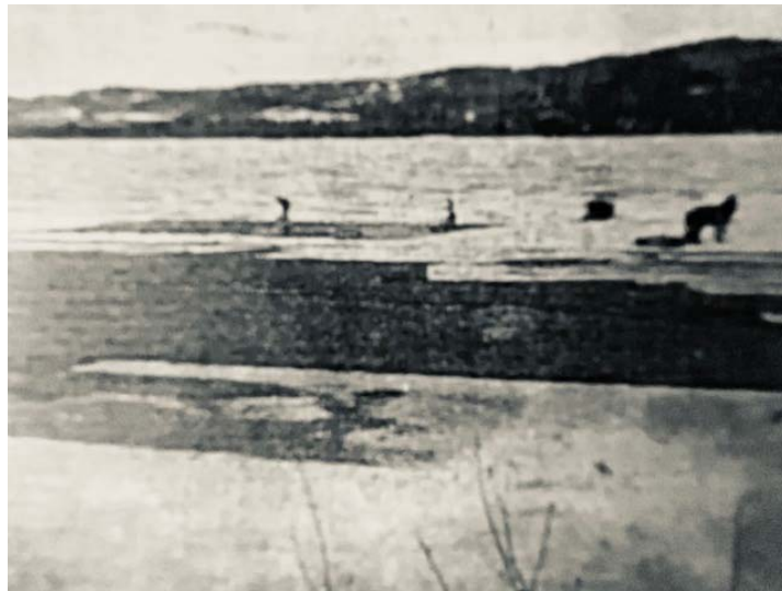
Men and Horses Harvesting Ice for Drake Farm at Six Mile Point