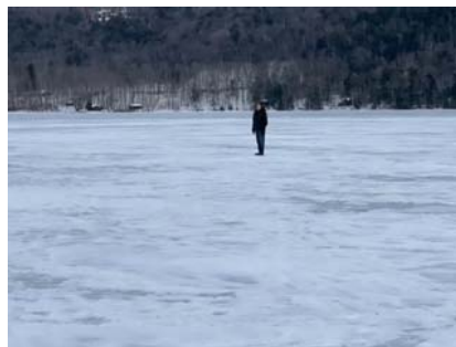
Walking safely on 9-inch-thick "old" ice