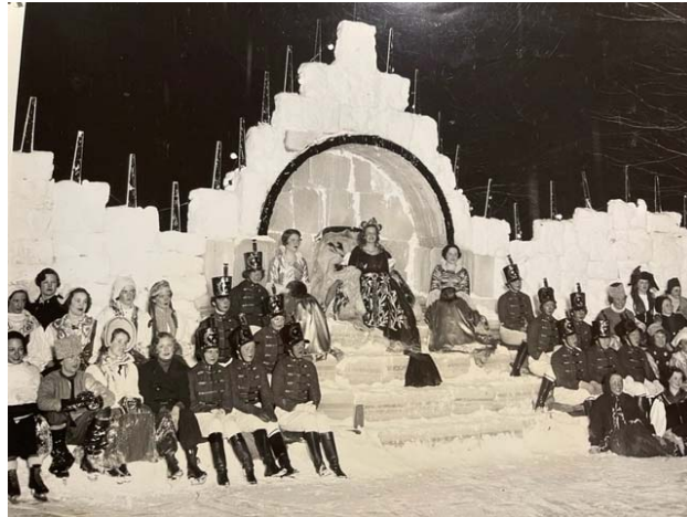
Ice throne, Knox School for Girls

courses, and Winter Carnival. ” There were ice sculpting contests involved in the Knox School’s Carnivals, and blocks were also used to create a throne for the reign of the Ice Queen and her Court. A 1935 Press Photo portrays a large, and carefully constructed throne: