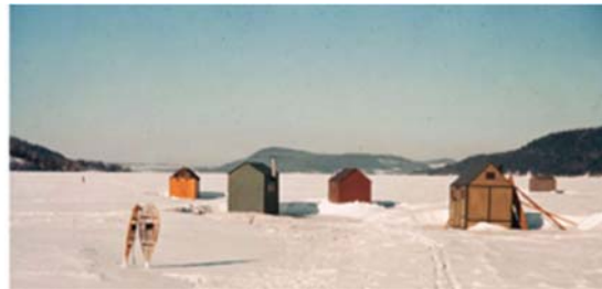
Circa 1962

More recently, many of us fondly remember the twentieth-century colorful “permanent” ice fishing shanties, which were brought out onto the ice when it was deemed safe, and then laboriously removed and stored for another season. Some of these huts were very well-equipped and provisioned, with reports of ample heat and possibly even libations! The distinctive shanties pictured below were located near Lakefront Park, and were built to last—unless, of course, they were left out too long while the ice was melting....