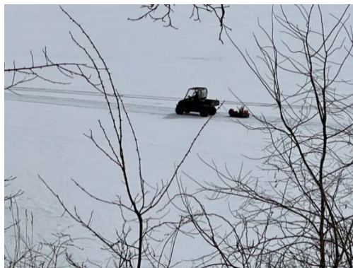
Headed out for a day of ice fishing 2022

Now, however, our fishing shanties are often pop-up structures, designed to be easily transported, assembled, and removed from the ice at the end of the day. We no longer bait our hooks for pickerel or salmon trout, but primarily for lake trout, walleye, and perch, and we fish through holes cut by powered augurs.