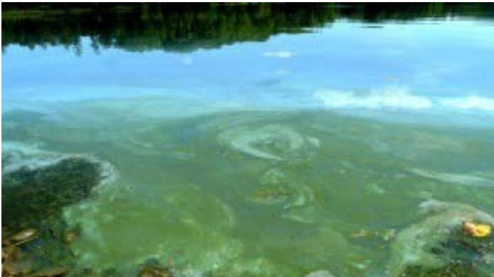
“Spilled paint” on the surface