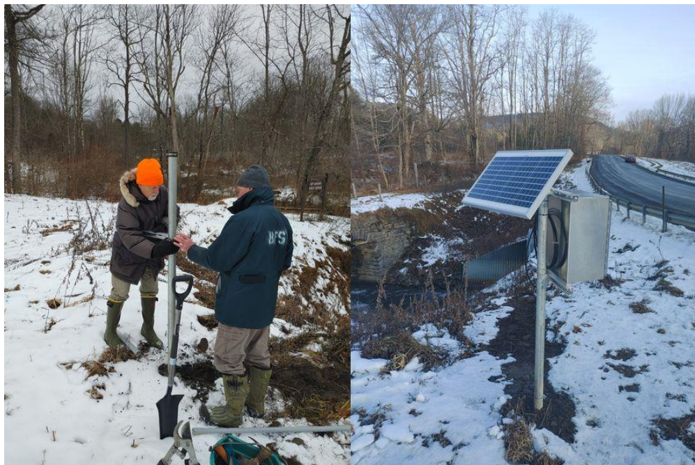
Installed radar stream monitoring station on Shadow Brook.

https://www.facebook.com/plugins/post.php?href=https%3A%2F%2Fwww.facebook.com%2FotsegoSWCD%2Fposts%2Fpfbid02HsAQFH1tRNQM5Q3gFo3X5B9udkQMEfwW4Q3oGPM4dJYZ55zP36o9c3tUYf8Vwg8DI&show_text=true&width=500