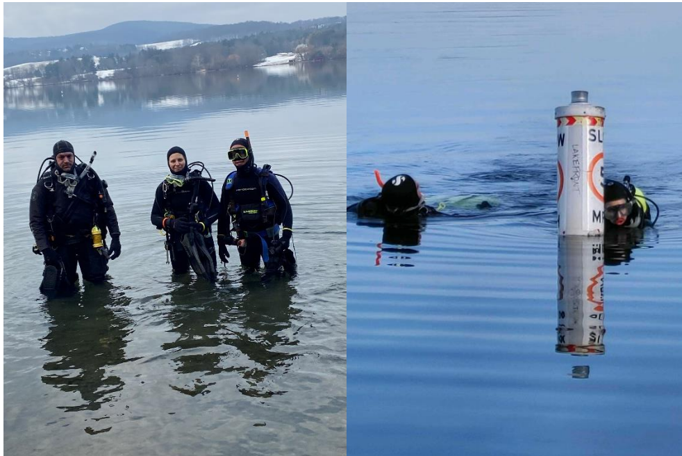
Volunteer dive team retrieves NWZB's, December 2023.