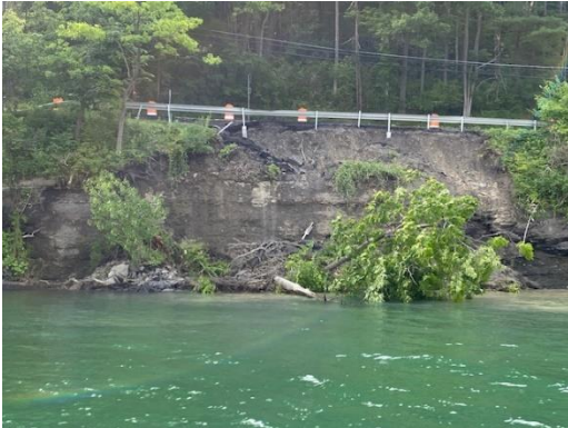
Bank failure, July 2023

Two embankment failures along NYS Route 80 on the westerly side of Otsego Lake occurred this past year. The first one in July 2023 south of Five Mile Point and the second one in