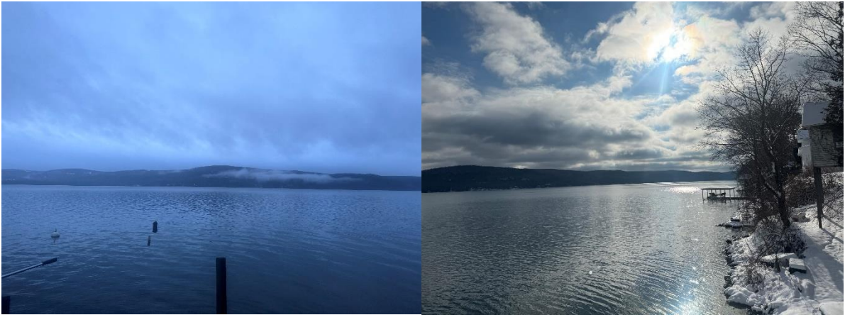
The divers are discouraged by the lack of ice which makes classic ice diving unlikely this year, February 2024.