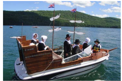
2017 Boat Parade