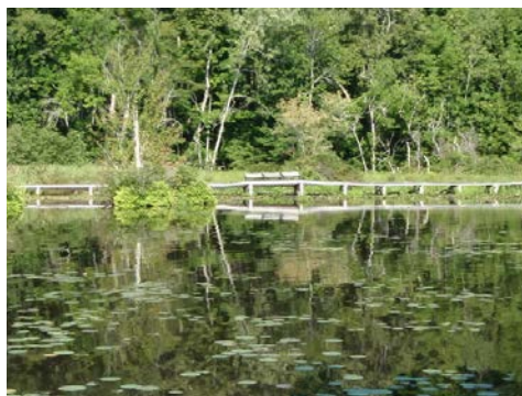
Goodyear Swamp Sanctuary Boardwalk: I♥NY

Ultimately, we all found our footing and the gears of bureaucracy began grinding forward again. During the delay we found that some documents had expired and needed to be redone. That meant new signatures, new notarizations, new authorizing resolutions. It seemed for a while that every time we sent a pile of documents to our program officer at the state, the response would be, “This is great, but...” It was quite the process.