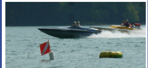
Boat speeding past dive buoy on Otsego Lake; Photo by Scottie Baker: