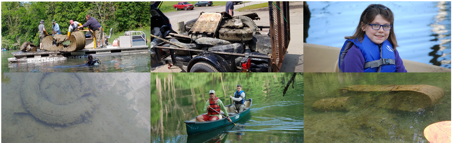
2019 Susquehanna River Clean Up; Special THANK YOU to the BFS Volunteer Dive Team and others who helped for the day!