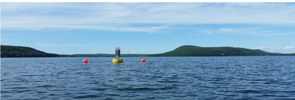
Knowledge (Continuous Lake Monitoring Buoy)