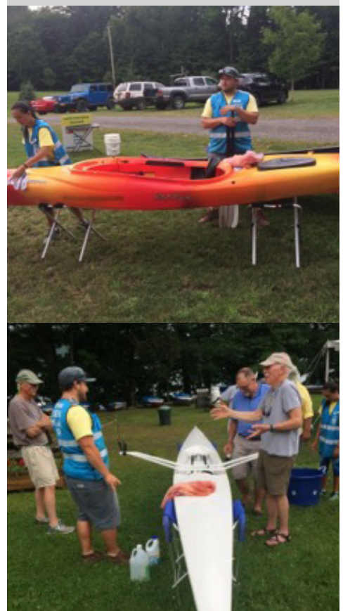
BELOW: OLA Invasive Species Day at Brookwood; How to properly clean possible aquatic invasives from a non powered watercraft: shell, kayak, canoe.

DID YOU KNOW? Under the ice, the warmest water is deeper in the lake.