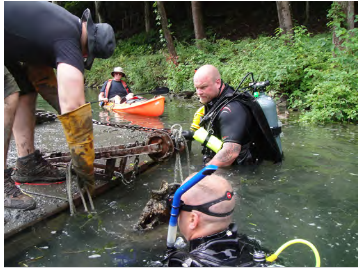
Above: Dive Team Volunteers haul debris out of Susquehanna River on a clean-up day held in September 2018 near Council Rock in Cooperstown.