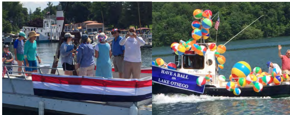
Summer 2018 Boat Parade

However, the July 2nd boat parade this year was really hot in more ways than one. In spite of the temperatures in the high 90s, plus the heat index in triple digits, the truly stalwart, dedicated boat parade lovers still joined in and adorned our pristine Otsego Lake with some very creatively decorated boats. See the OLA website for more photos. The 2019 boat parade is already scheduled for Thursday July 4th at 4:00 PM with a theme of "Red, White, and Blue - It's the 4th of July".