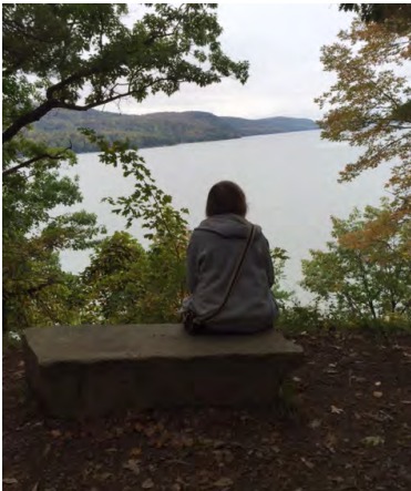
Woman reflects on decades of memories of Otsego Lake