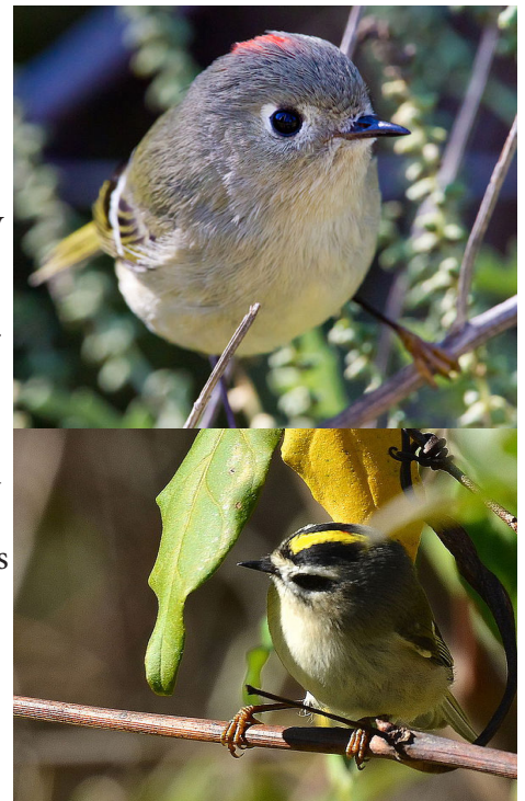
Top: Ruby-crowned kinglet - Photo CC Cheepshot; Bottom: Golden-crowned kinglet Photo: CC Dan Pancamo.

On Public Landing Road, I watched a downy woodpecker peck at a gall on a mustard stalk for a protein rich meal. I am told by a very reliable source that loons are on the lake. We are indeed fortunate. - Becky Gretton