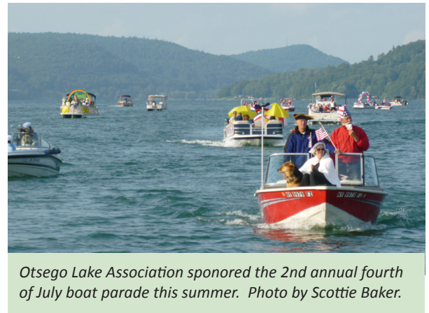
Otsego Lake Association sponsored the 2nd annual fourth of July boat parade this summer.