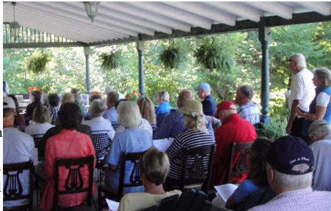
OLA 2015 annual meeting at the Otsego Golf Club on the north end of the lake.

After much hard work, the groundwork has been laid. Permission has been obtained from the Village Board, a site plan has been generated, and bids are being solicited for a boat wash at the Cooperstown lakefront. This is an expensive project that will require a large financial commitment on our part and support from our like-minded organizations as well. Our goal is to see this project completed in time for next year's boating season. We are proud that OLA has taken the leadership role in this project and are committed to seeing it through to completion!